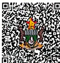
Chief Registrar of Companies

This form is issued in terms of the COMPANIES AND OTHER BUSINESS ENTITIES ACT [CHAPTER 24:31]