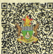
Chief Registrar of Companies

This form is issued in terms of the COMPANIES AND OTHER BUSINESS ENTITIES ACT [CHAPTER 24:31]