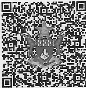
Chief Registrar of Companies

Given under my hand this 11th day of March 2025